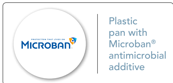
Plastic pan with Microban® antimicrobial additive

Mold is part of our environment and there are no practical ways to completely eliminate mold spores.