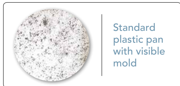
Standard plastic pan with visible mold

Microbes can double every 20 minutes on an untreated surface!